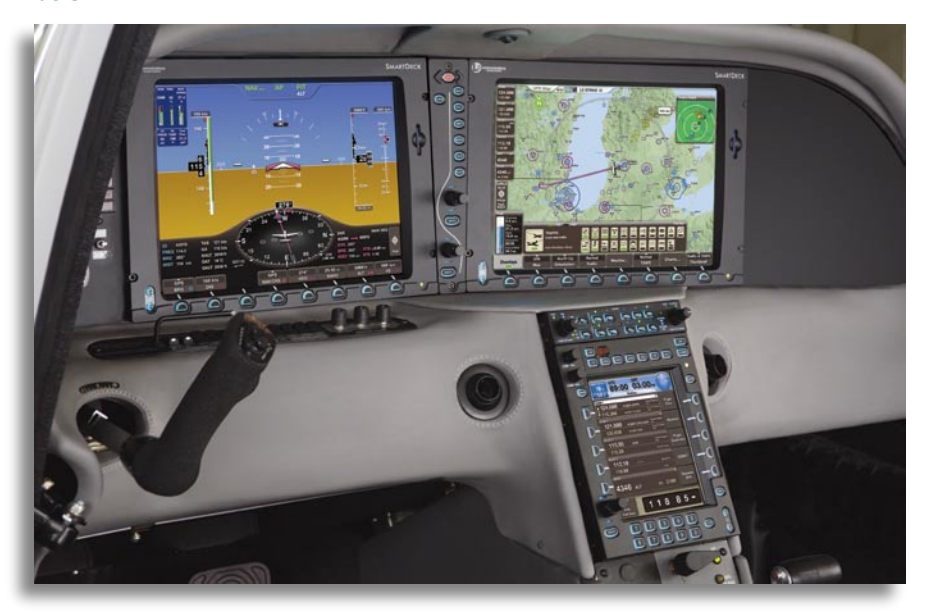
The SmartDeck® Integrated Flight Controls & Display System installed in the cockpit of a Cirrus SR22.

L-3 Avionics Systems employs more than 500 people and is a division of L-3 Communications, which is the sixth largest defense company in the United States with 2006 sales totaling more than 12.4 billion dollars. L-3 is one more way in which GFIA connects with the global economy.