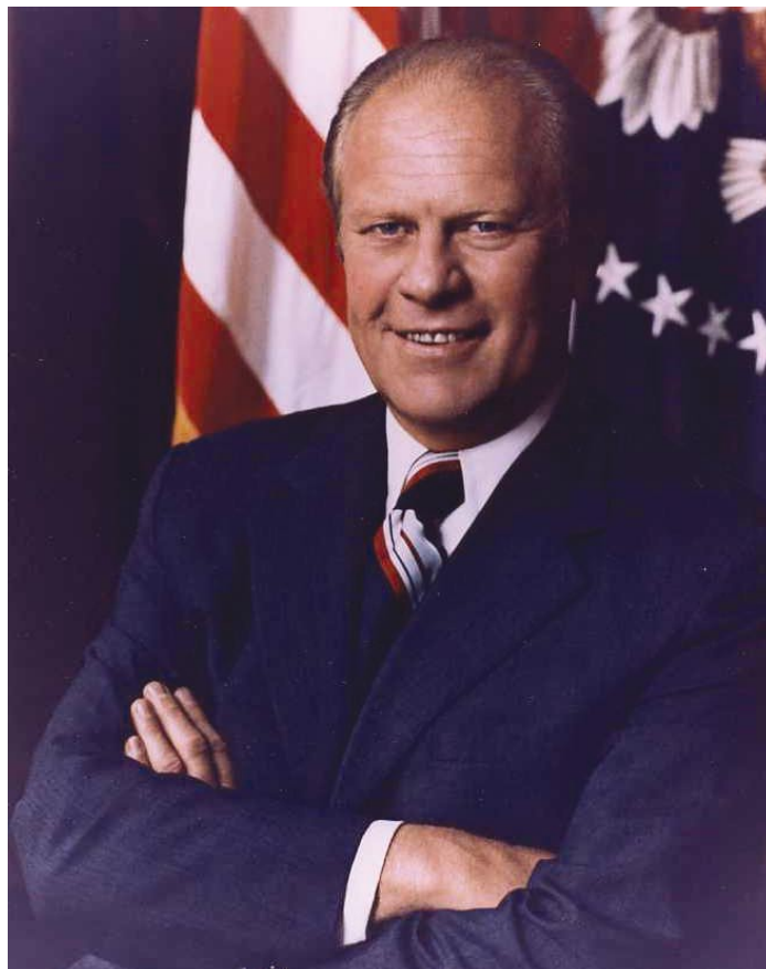
Gerald R. Ford July 14, 1913 to December 26, 2006