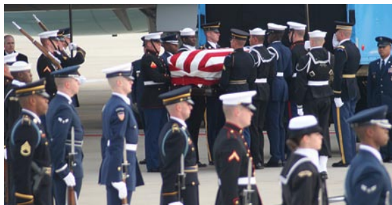
President Ford’s casket is carried off Air Force One.

Upon arrival at the airport on Tuesday, January 2, 2007, the passengers on board the presidential 747 were escorted onto the aircraft ramp for a brief, meticulously scripted ceremony that would include “Hail to the Chief” and “Hail to the Victors,” played by the UM Marching Band, the removal of President Ford’s flag-draped casket from the aircraft and its ceremonial transport to the waiting limousine, and a 21-gun salute using howitzer cannons. Shortly thereafter, the motorcade began its journey into the city of Grand Rapids.