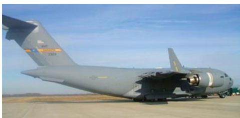
C17 sits on the cargo ramp after delivering equipment and supplies.

The Secret Service arrived, accompanied by members of every branch of the United States military. Airport security protocols were