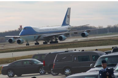
Presidential 747 arrives with President Ford's casket, accompanied by Mrs. Betty Ford, President and Mrs. Jimmy Carter, and other dignitaries.

On December 26, we learned that President Ford had passed away. It was the beginning of nine intense days for many of