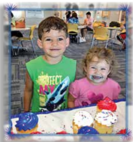
Who could help but smile at these sweet faces?

It was our smallest travelers who seemed to have the most fun at the party with balloons and cupcakes as a part of the celebration. Needless to say, the blue cupcakes were the most popular and left the best frosting faces!