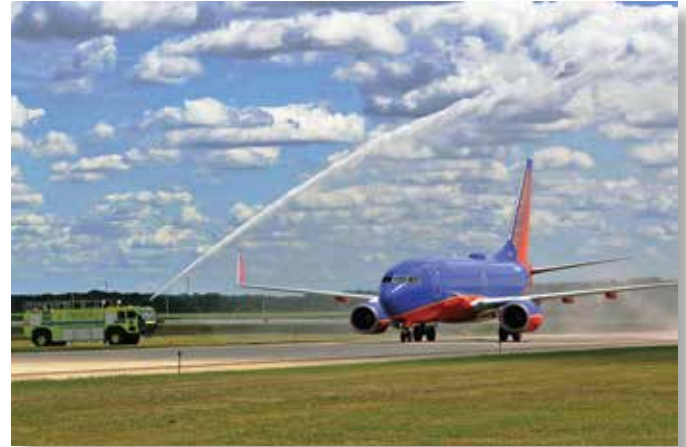
The first arrival was celebrated with a water cannon salute by the Aircraft Rescue Firefighters.