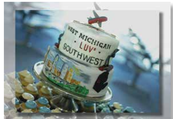
LUV doesn't get any sweeter than this beautiful and delicious cake created by the Cakabakery!