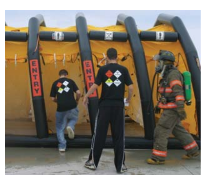
'Victims" enter the decontamination tent following exposure to a chemical nerve agent during the exercise.

There has never been a major accident or terrorist incident at GFIA in its 42 year history. However, the airport and its mutual aid partners remain in a high state of preparedness, just in case. >