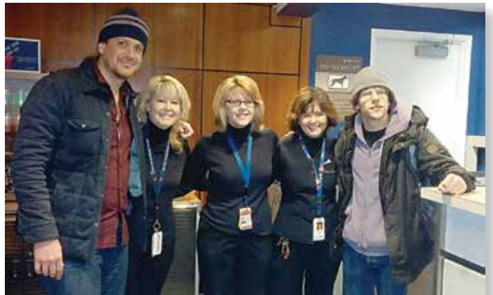
Before departing Grand Rapids, Jason Segel (left) and Jesse Eisenberg paused for a photo with a few of the Delta Airlines staff.