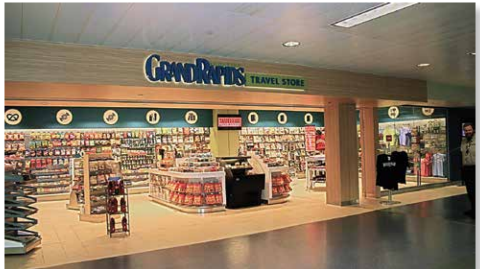
At GFIA, your retail shopping experience is brought to you by the World Duty Free Group which operates 550 stores in 100 airports located in 21 countries around the world.

The new store, however, offers much, much more. You will find coolers packed full of your favorite beverages, a wide variety of snack options, and a large array of books and magazines. There are also some unique West Michigan souvenirs and Michigan-made products. There’s a good chance you’ll find exactly what you need before boarding your flight.