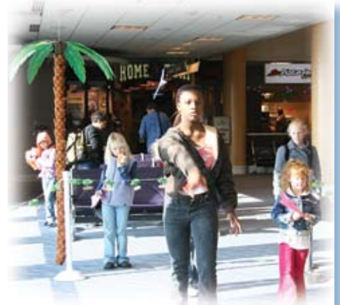
The paper airplane-flying contest is one of the most popular events, and creativity abounds as travelers fold their own flyers for that maiden voyage through the Grand Hall.