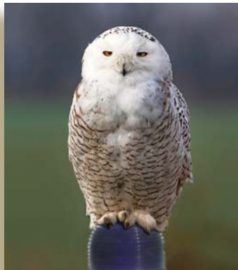
Female Snowy Owl perched on a taxiway light near the airfield.

At nearly two feet tall, the Snowy Owl is the most massive of the North American Owls, weighing 4-5 lbs. each, with a wingspan of 54-66 inches. The Snowy Owl is usually monogamous and pairs for life. With a life span of 10 years in the wild, GFIA has probably hosted five or six different pair over the airport's history, and the staff looks forward to their return each winter.