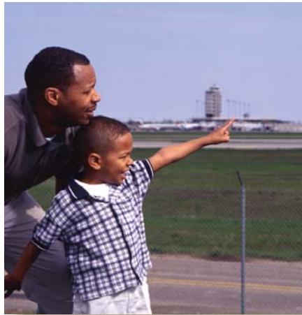
A father and son enjoy watching airfield operations together from the GFIA viewing area.

A new low-power, specific area radio station is broadcast only to the viewing area and was designed to add a whole new dimension to your viewing experience. While you are taking in the sights, just tune your radio to 1650 AM to enhance your bird-watching experience. You can hear the pilots as they request permission to take off and land, listen to the Air Traffic Controllers as they vector in a series of aircraft, and hear airport operations staff as they report on airfield and runway conditions. If you're lucky, you might even be watching when the military aircraft are in the area practicing their maneuvers.