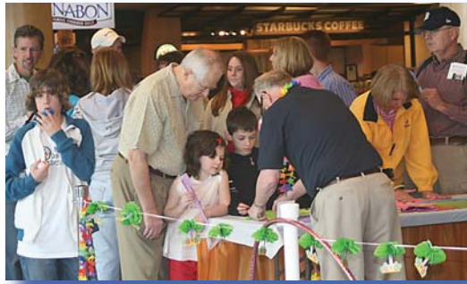
With contests, drawings, food, and fun, Passenger Appreciation Days has something for everyone.