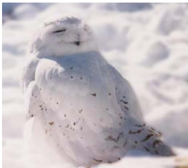
Male Snowy Owl "hiding" on a blanket of snow on the airfield.