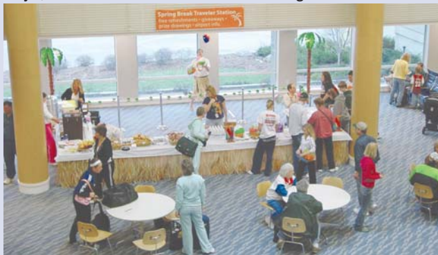
The Grand Hall hospitality station was a popular stop for travelers during Passenger Appreciation Days.