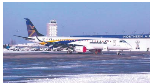
Embraer E190 Regional Jet during the January Ice Flight Test Campaign.

And on January 25, test pilot Joao Rafael de C.M. da Silva and his crew brought an Embraer E190 prototype jet to Grand Rapids to test the effects of Type IV de-icing fluid on the take-off performance of the aircraft. Type IV fluid (propylene glycol) is the thickest of the de-icing fluids. As part of the certification process, aircraft must conduct these performance tests to show that aircraft handling is not hindered by the use of the fluid.