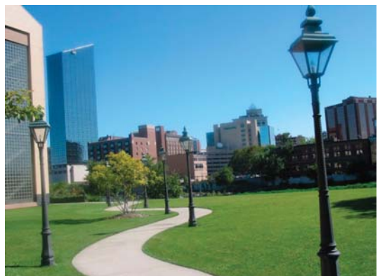
3rd place photo taken by Corinne Barrio of Grand Rapids, MI

Corinne wins a Tamrac Travel Pack 71 photo backpack for her image of downtown Grand Rapids.