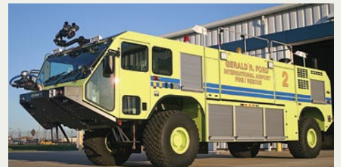
Open house visitors can be among the first to check out the BRAND NEW Oshkosh Striker 1500 fire truck!

For more information about the Toys for Tots program, or to see if your family qualifies, call the Holiday Hotline at (616) 459-2625.